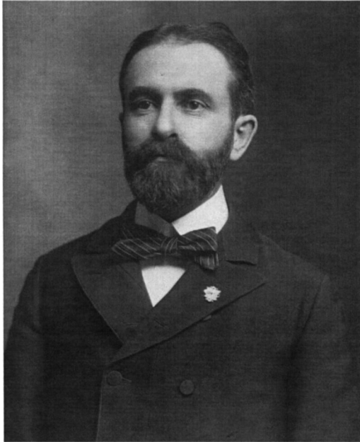
FIGURE 1. Portrait of Bruce Fink (1861–1927) from December 27th, 1900.

databases. The literature on lichens of Puerto Rico is dispersed, including some important contributions that are unpublished or of limited distribution, the literature cited aims